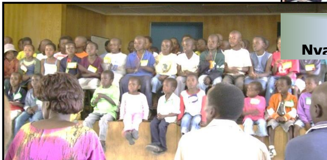
Bible School program