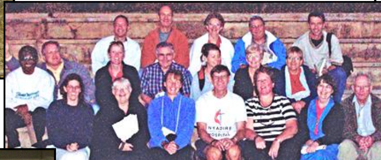
18 Pittsburghers who traveled to Nyadire United Methodist Mission in 2006