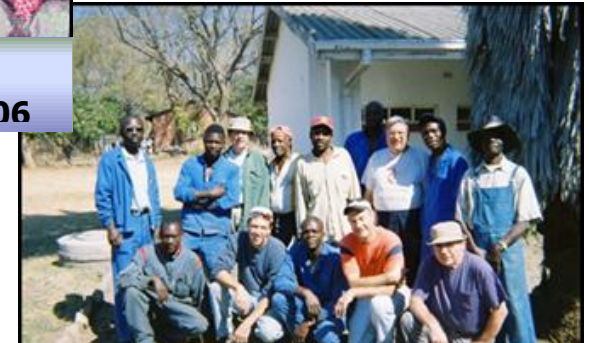
Working together on construction project

Follow along each week to learn about TNC's varied programs; maybe you will become a TNC volunteer, too! Each day, read what is written on the calendar for that day and learn something new while you help support TNC's programs!