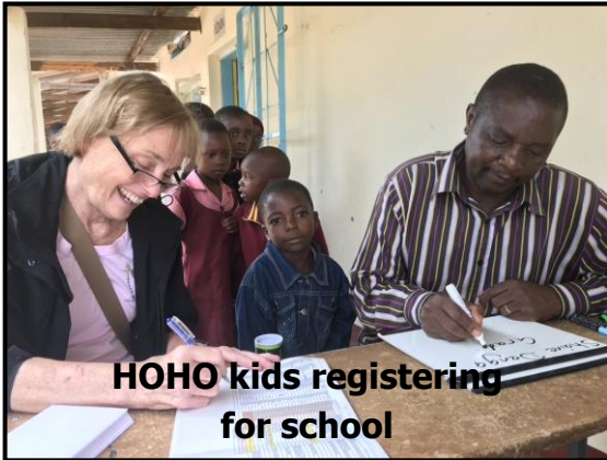
HOHO kids registering for school