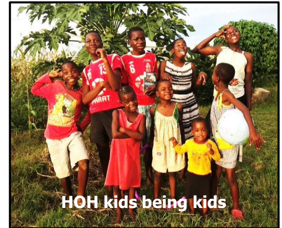
HOH kids being kids

HOH children have chores such as herding cattle, feeding the pigs, watering the garden, washing dishes, sweeping, chopping wood, etc. The children enjoy coloring, reading, playing soccer, sewing, knitting, mechanics, and on special occasions watching TV. Their favorite foods are sadza (based on cornmeal), chicken, collards, and rice.