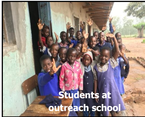
Students at outreach school